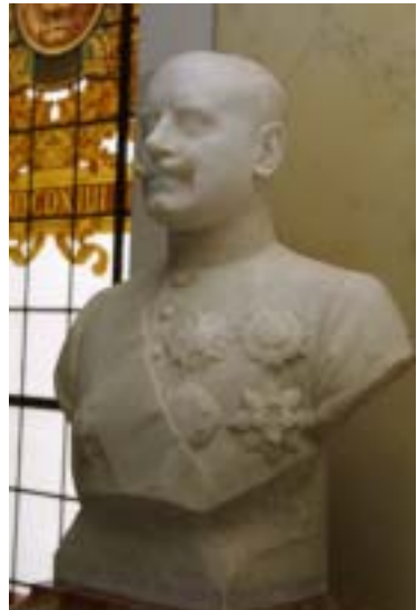
The Prime Minister Carton de Wiart (1869 - 1951)

Under the government of Henry Carton de Wiart, universal suffrage was written in the Constitution on February 7 th , 1921. From that date forward, all men aged 21 and over were given the right to a single vote.