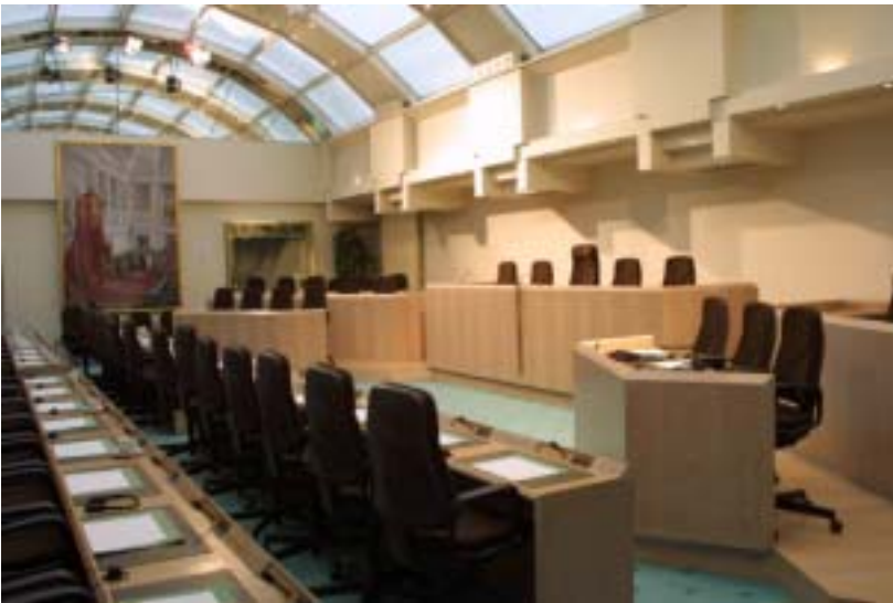
The International Room.

Most of the committee debates are open to the public.