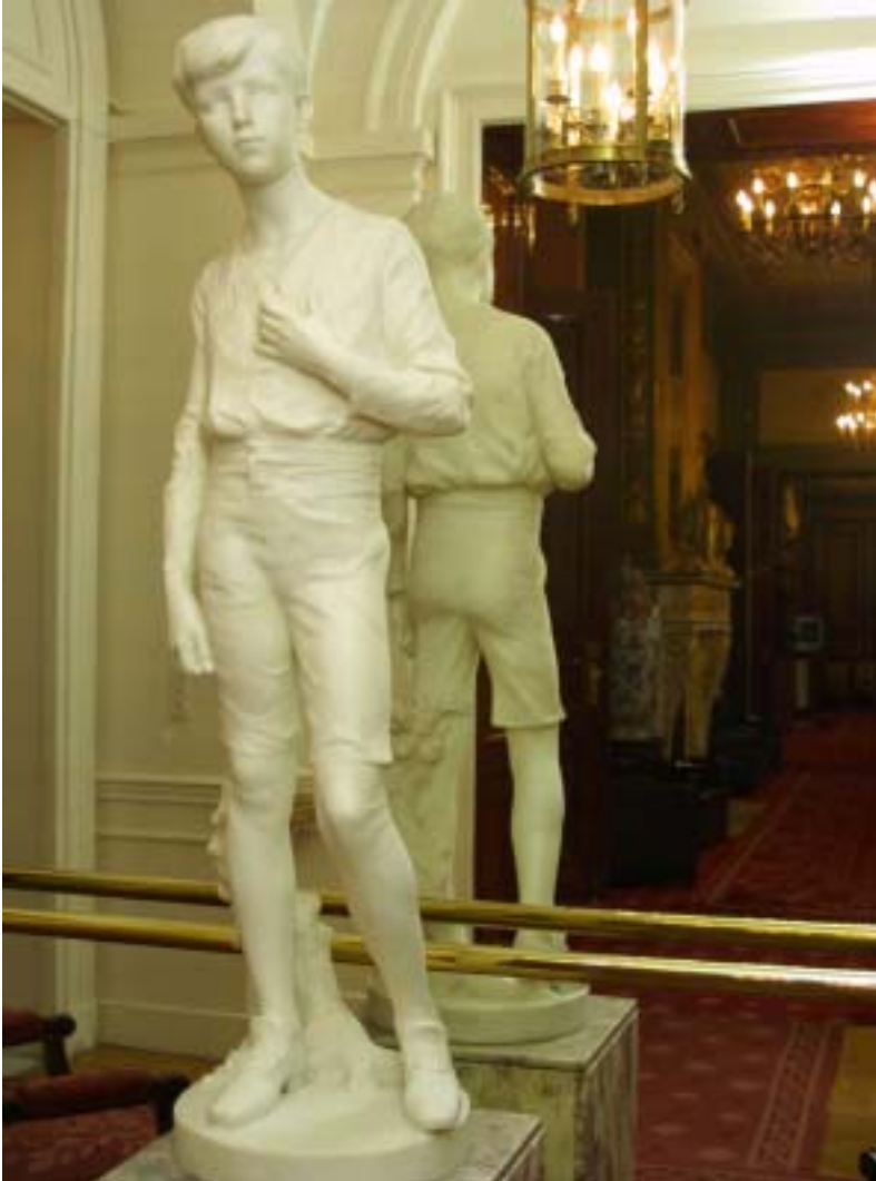
The Duke of Brabant, the future King Leopold III, a statue sculpted by P. Dubois.

As you leave the Senate reading room and head towards the Senate plenary room, you cannot miss the elegant white marble statue of the Duke of Brabant as a child, the future 73 King Leopold III.